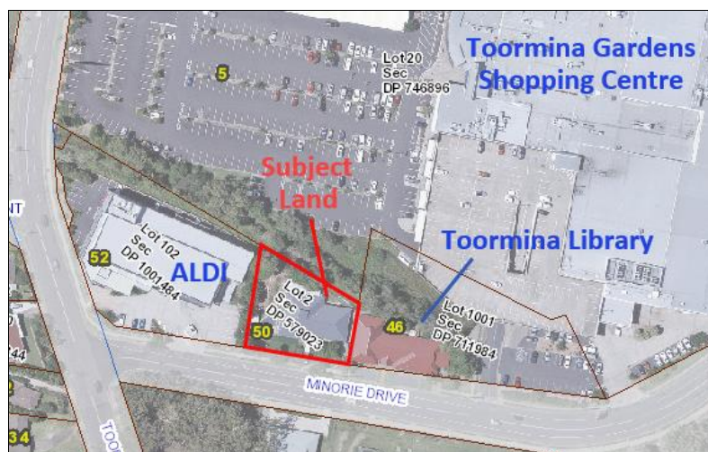
Figure 1: Location of the Subject Land

The subject land is Lot 2 DP 579023, 50 Minorie Drive, Toormina and has an area of 1,343 m 2 . The nearest major street is Toormina Road. The subject land is located between an ALDI supermarket to the west and the Toormina Library to the east. Toormina Gardens Shopping Centre is located to the north. The current land use zoning under Coffs Harbour LEP 2013 is B2 Local Centre. The subject land is shown in Figure 1.